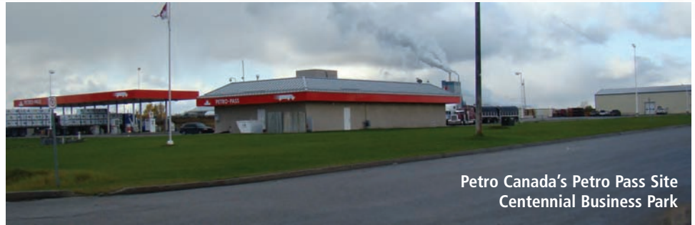
Petro Canada's Petro Pass Site Centennial Business Park

Available right now, commercial lots in Dryden's Centennial Business Park are ready to help you profitably serve your local and long-distance markets.