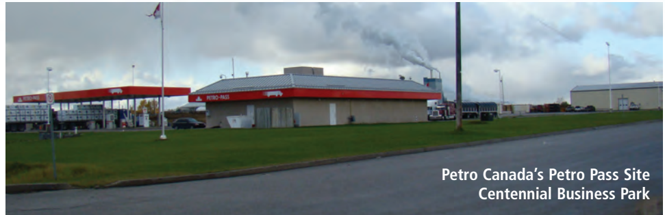
Petro Canada's Petro Pass Site Centennial Business Park

Available right now, commercial lots in Dryden's Centennial Business Park are ready to help you profitably serve your local and long-distance markets.